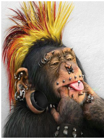
And then we will have Wu Kong, the Monkey King. Or maybe Punkey King.

Since PSYCH has gone public with its predictions, twelve students belonging to the organization have been committed to the local mental institutions and/or government agencies anonymous. The names of those individuals have not been disclosed to the public. Whether or not this lends credibility to the group we may not know for another couple of years. 🐼